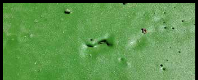
Pinholes in a liquid coating